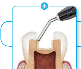
Apply Fusio™ material in 1mm increments.